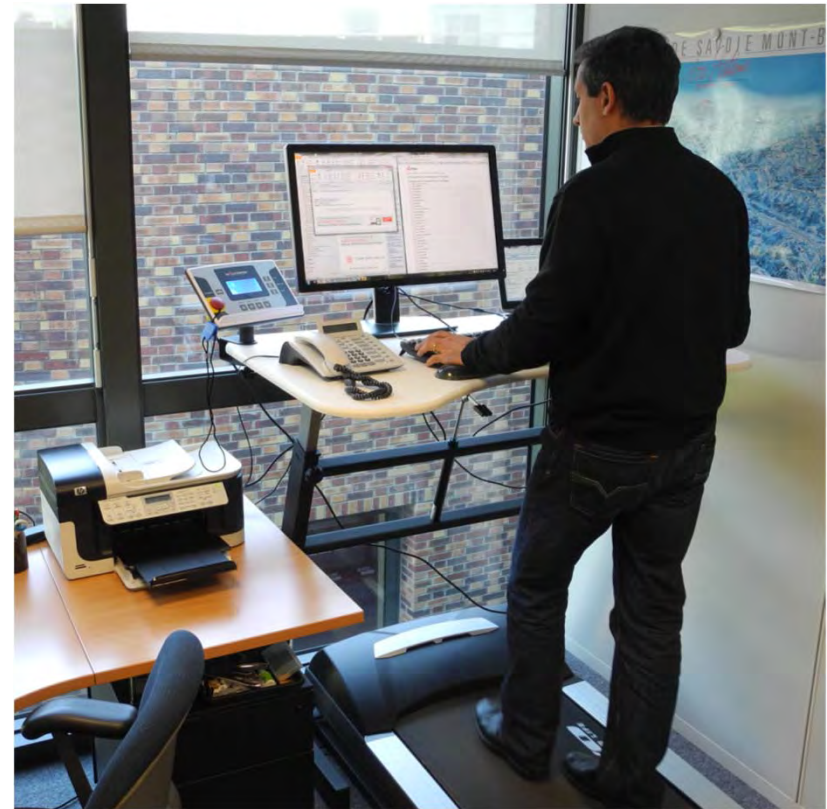
Treadmill desk