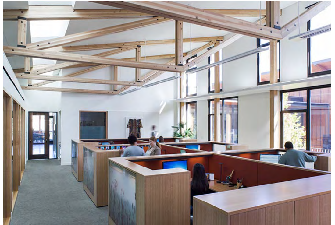
CBE Livable Buildings Award Winner 2014 The David & Lucile Packard Foundation Headquarters Credits: EHDD, Integral Group, Tipping Marr, Salter Assoc., DPR Const.